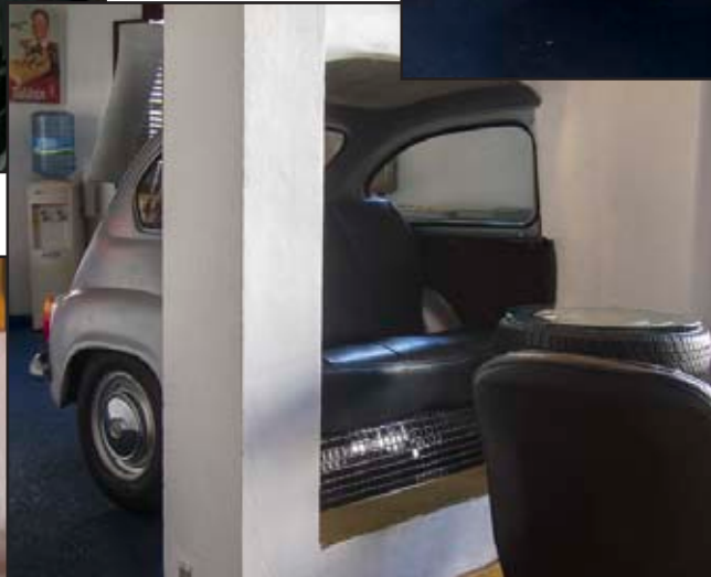
While Cocktails Are Served To The Same Fiat's Back Seat Lounge