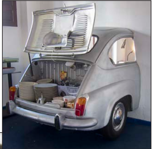
Breakfast Service From A Fiat Trunk....