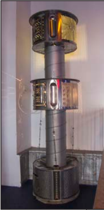
Re-Purposed ???? To Light Fixture