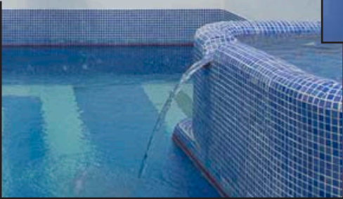
Blue Hand Luke Pool