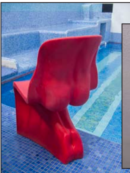
Form Fitting Seating...