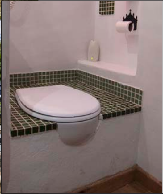
Built In Fixtures