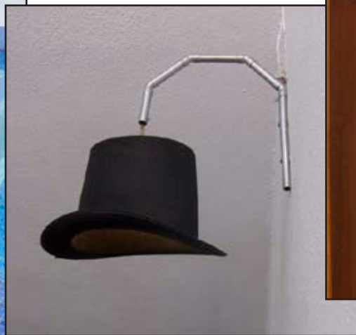
Top Hat Lighting