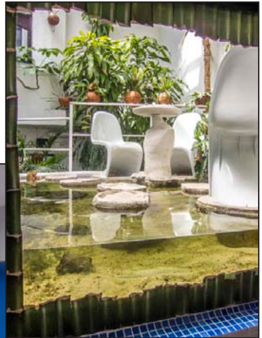
Cocktails In The Pond?