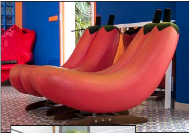
May West Banana Seats?