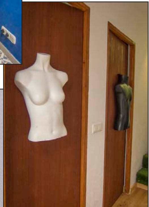
Men's & Women's? Black & White? Left & Right? Didn't matter!