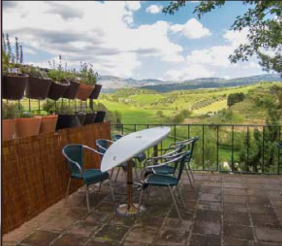
Surfs Up In Ronda?