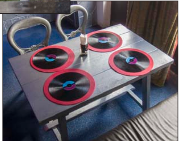
Breakfast Room And 33.3 RPM Place Mats