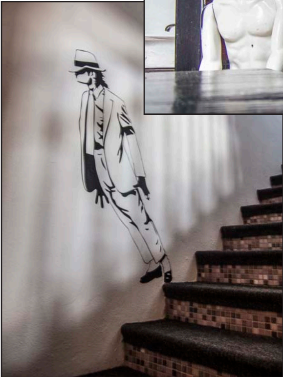
Michael 'Air' Jordon Is Here... No, No... Wait... Jackson! Yea, Jackson!