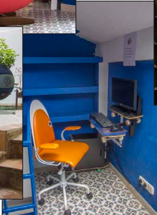
Staying Connected With Skateboard Speed