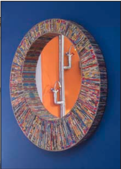
Mirror In The Multi-Media Room