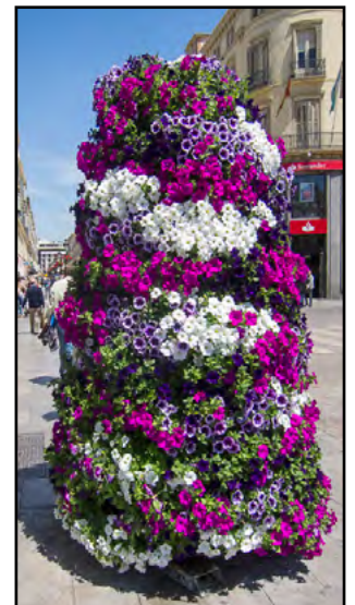
Poulsbo's flower theme on steroids...