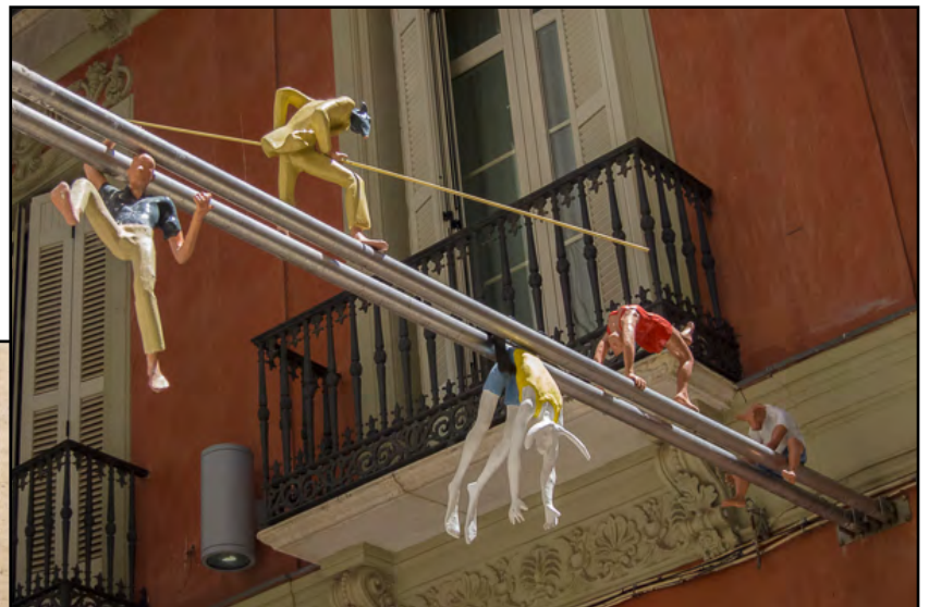
More Malaga characters providing chaos and entertainment above.