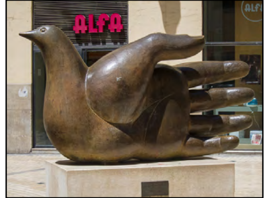
Malaga Public Art