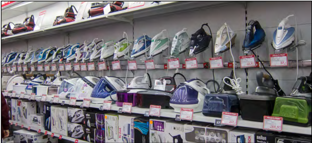
There was no lack of choice in this Malaga department store....