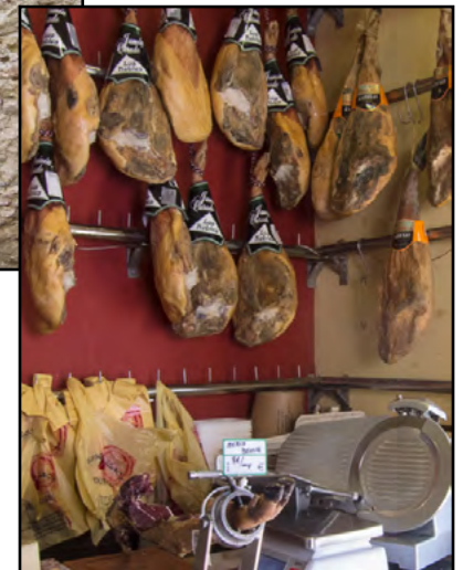
Ronda has a history of vampire plagues too, making it a sister city to Forks, WA