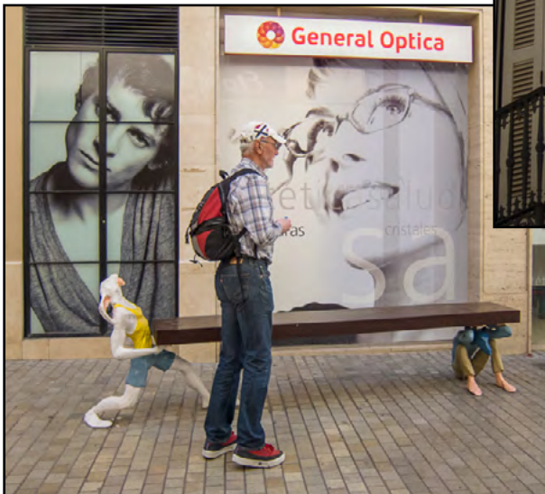
Malaga characters providing a resting spot for us weary travelers.