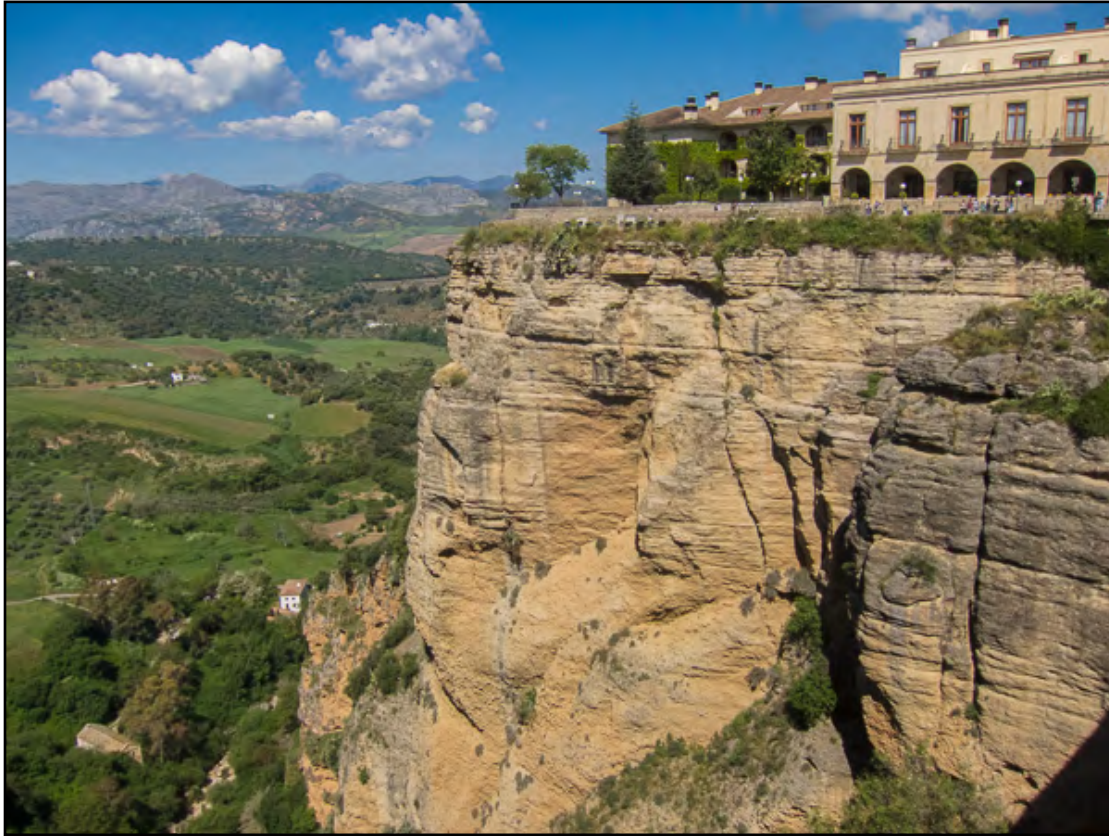
Another of the many great views from Ronda.