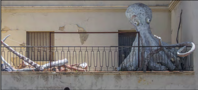
An octopus arm loss crisis on a Malaga balcony....